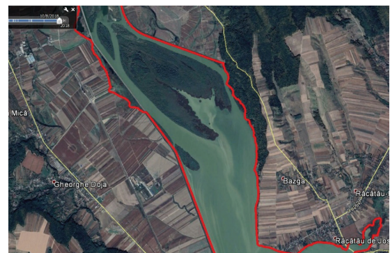
Figure 3. Răcăciuni reservoir, part of ROSPA0063 Reservoirs Buhuși – Bacău - Berești: dark green – the limits of suitable vegetation for birds in 2018 (satellite image 2018, Google Earth).